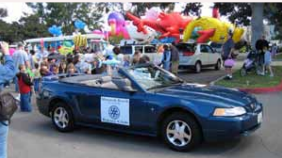
MBSR Rotary participated in last year's Festival of Whales parade