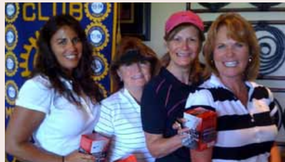
Women's Division Champions