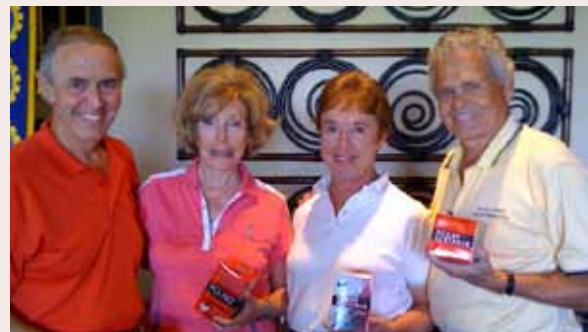
Mixed Division Champions