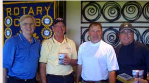
Men's Division Champions