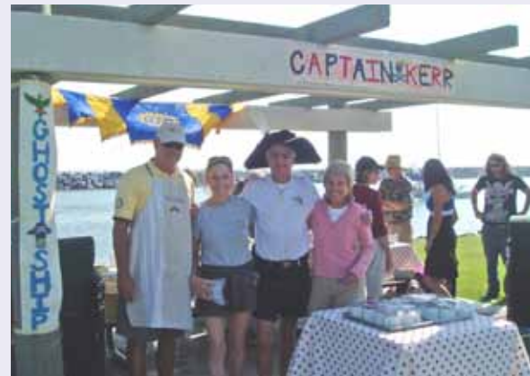
Ahoy Maties! MBSR enjoys some Pirate Fun

Please join the Captain again on his next voyage beyond the Carlton Coast. And remember: THERE WILL BE CHOCOLATE!