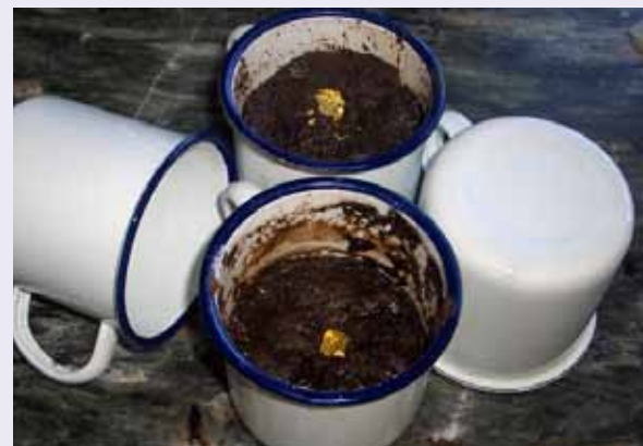
Chocolate Treasure Pots with 24 karat gold leaf!