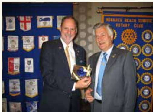
Governor Elect Bret Gerdes receiving the MBSR Wheel of Chocolate