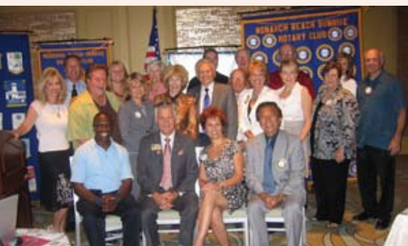
The gang's all here! The Monarch Beach Sunrise Rotary 2009-2010 group of officers, directors and committee members.