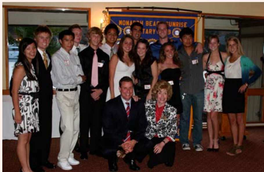
Students and Rotarians had a blast at the Student of the Month Banquet.