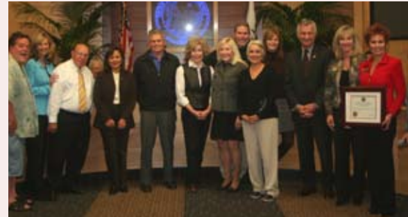
MBSR receives "Non-Profit of the Year" award!

Congratulations to the entire membership! ■