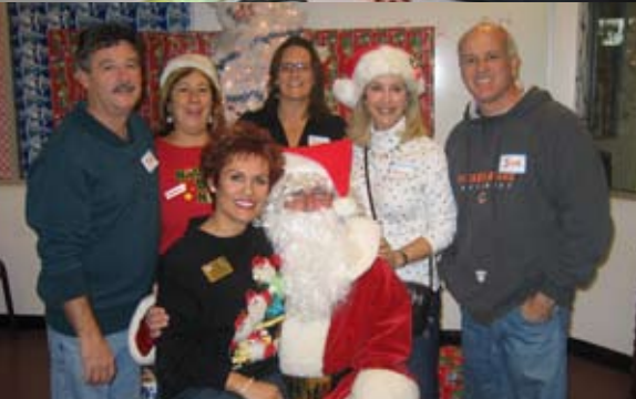
Above three photos: The Boys and Girls Club of San Juan Capistrano Holiday Shopping Spree.

The Boys and Girls Club sets up all room at the facility and the students are allowed to begin shopping at 8am on Saturday morning. They are allowed to take one gift for each family member and then take the gift to the back room for wrapping and labeling. The students are allowed to come into the facility that day based on a point system—they earn points by getting their homework done each day after school. The students with the highest points by December 1 get to shop at 8am. The next highest 8:30am and so on. It is a great incentive for the students and each year more and more earn higher points after seeing what great gifts they have to choose from by getting there early.