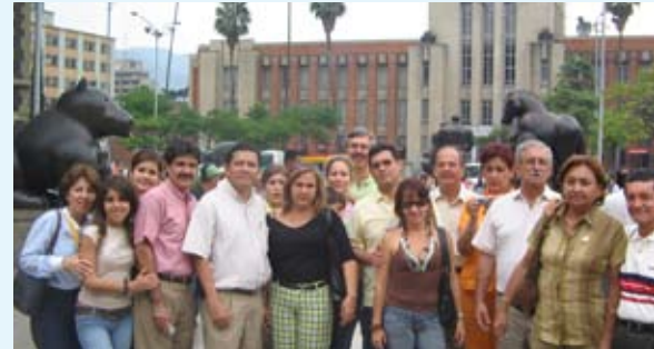
Rotarios Neiva, Medellín, Colombia

Another great project made possible by the power of Rotary International – Matching Grants with support from three local Southern California Rotary Clubs and a Rotary Club in Colombia.