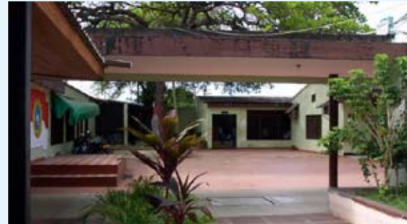
School building and courtyard