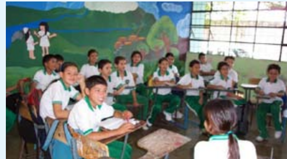
Students in the classroom