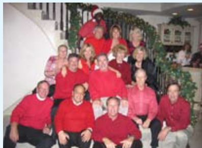
Rotarians and Family Members