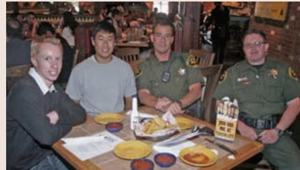
Officers from OC Sheriff's Department Host Students