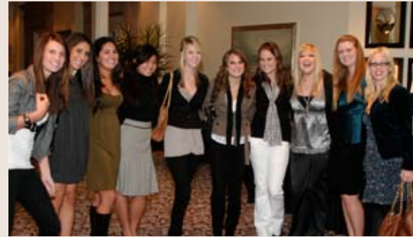
Students eagerly lined up for Career Day at The Ritz-Carlton

It's a big, bright beautiful day, and very fulfilling. A big “thank you “ to all of our members, and to the Ritz-Carlton Hotel.