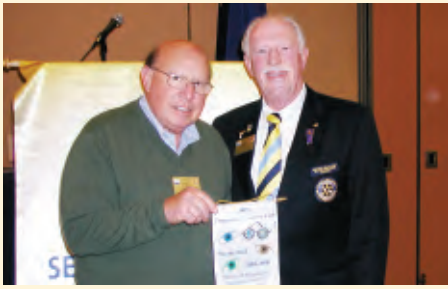
MBSR receives the Preventible Blindness Flag from Dist. Gov. Peloquin for 100% participation in giving to the District