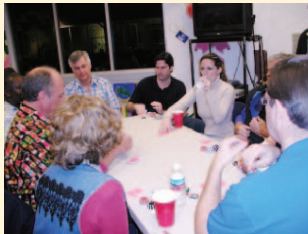
So who bluffed this hand?