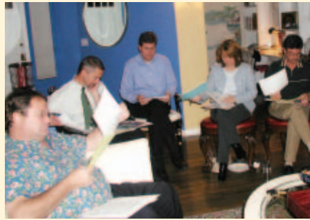
Some new members during Fireside Chat at the Eide home