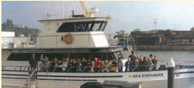
Students ready for the boat trip!

MSBR has just done a good deed for several children in our community! On January 13, 2006, and again on January 17, 2006, we adopted three elementary classes (each day) from Concordia School in San Clemente. The kids were excited to be at the Ocean Institute, and even more excited to go out on the R.V. Sea Explorer. Lenka Spechalova , the coordinator, introduced us to the kids and told them that they were here because Monarch Beach Sunrise Rotary had sponsored them for the day. A big cheer went up!