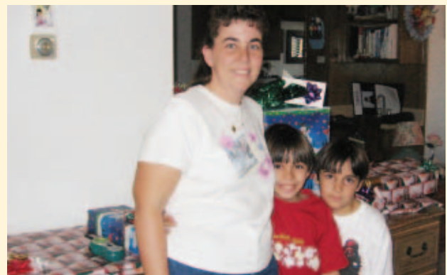
One of the families adopted by MBSR for Christmas is pictured with gifts—a dresser with presents! The kids wanted to open the presents right away, but we talked them into waiting for Christmas. Dad was at work when presents were delivered and Mom was so grateful for Rotary's generosity.

The angel of giving was praying one night Saying thanks MBSR you're a beacon of light!