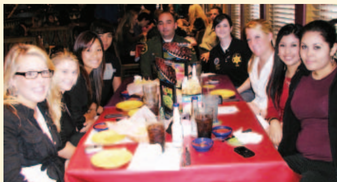
Students enjoy lunch with hosts from Orange County Sheriffs Department.