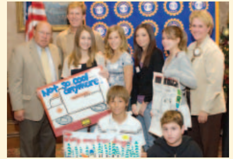
“Drug Use is Life Abuse” Poster Contest Winners receive prize money from MBSR