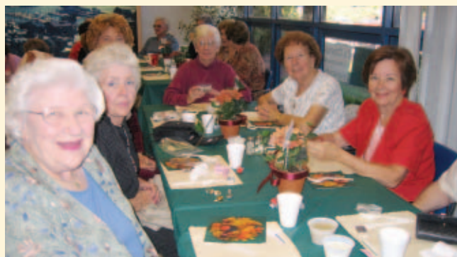
Seniors await the Thanksgiving feast!