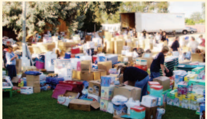
Rotary District Donations to Katrina Victims

Aren't you proud to be a part of such a great organization?