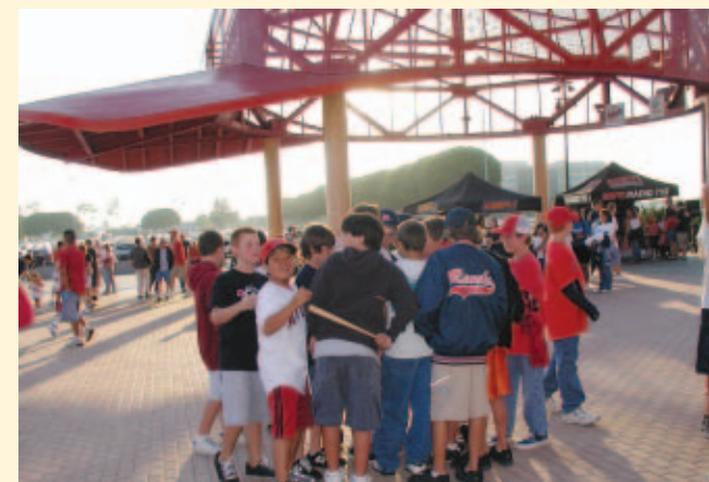
MBSR sent kids from the Boys & Girls Club of Capistrano Valley to an Angels Game - each received an Angels cap and $20 for food and souvenir