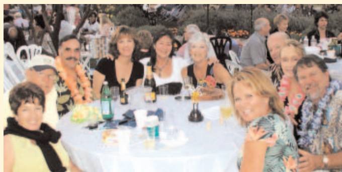
Last month, Rotarians enjoyed an evening of Swing dancing, dining, and fellowship under the stars at the Mission San Juan!