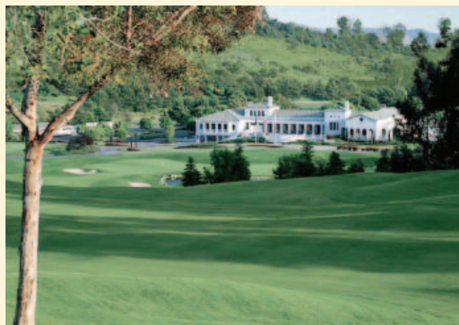
Marbella Golf Club

Thanks in advance for your help. We can NET close to $30,000 from this event—to give to charities next June.