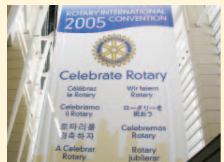
Rotary Banner displayed at the Convention Hall in Chicago