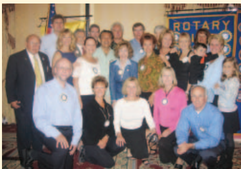
Officers, Directors, & Committee Chairs for 2005-2006