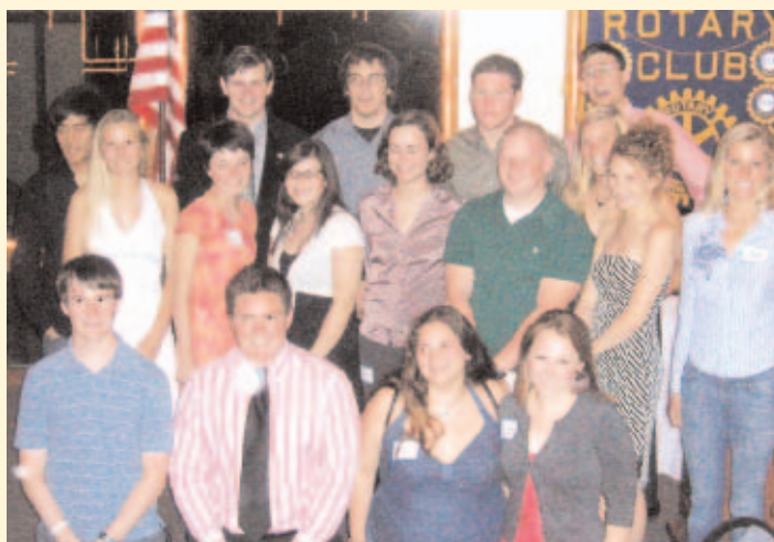
Student of the Month Banquet