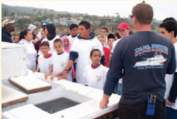
Ready to go Fishing!

MBSR's 9th annual deep sea fishing trip had help this year from Friends of Rollo - U.A. Friends of Rollo is an organization that introduces children to marine life and our ocean environment through its kids fishing program. Founded in 1999, they reach out to underprivileged or special needs children, church groups, recreation groups, mentoring programs, etc. They always arrange to pay for the galley, so this year the children were able to choose either breakfast or lunch on the boat.