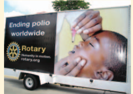
One of the parade floats at the International Convention in Chicago