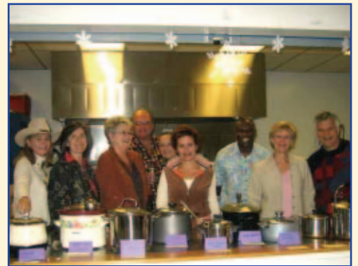
Chili Cookoff Chefs

Will there be a second annual chili cookoff / poker party? It's probably a safe bet that there will be. Thanks to everyone, especially the chili chefs who made the evening so much fun.